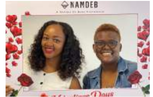
CELEBRATING VALENTINE'S DAY - FEBRUARY