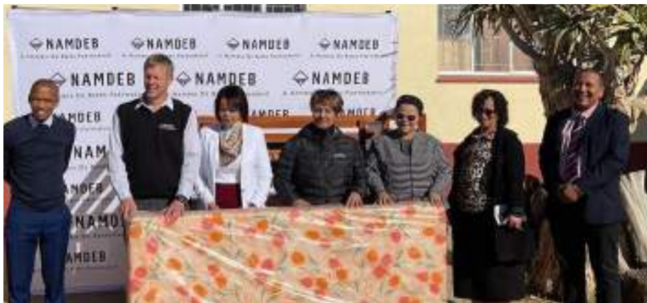
NAMDEB DONATES MATTASSES TO //KHARAS COMMUNITY HOSTEL