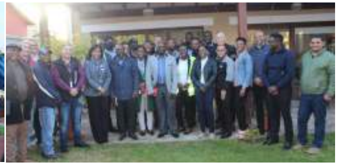
BOARD VISIT : JULY