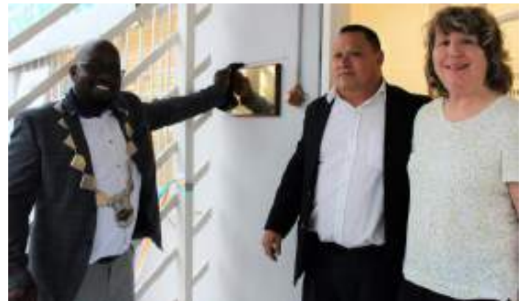
OPENING OF THE JASPER HOUSE MUSEUM