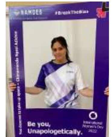
CELEBRATING INTERNATIONAL WOMEN'S DAY - MARCH