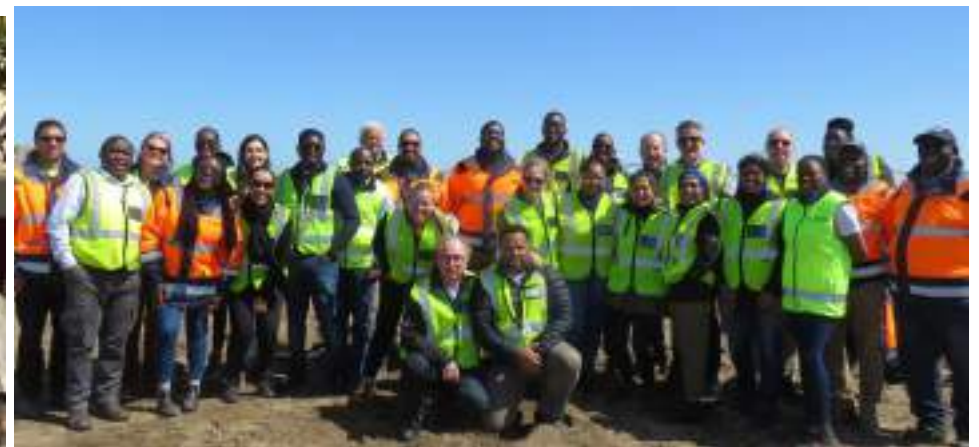
DE BEERS GROUP HR LEADERSHIP TEAM VISIT NAMDEB OPERATIONS