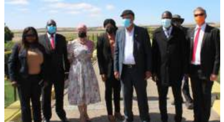
REOPENING OF ORANJEMUND BORDER POST