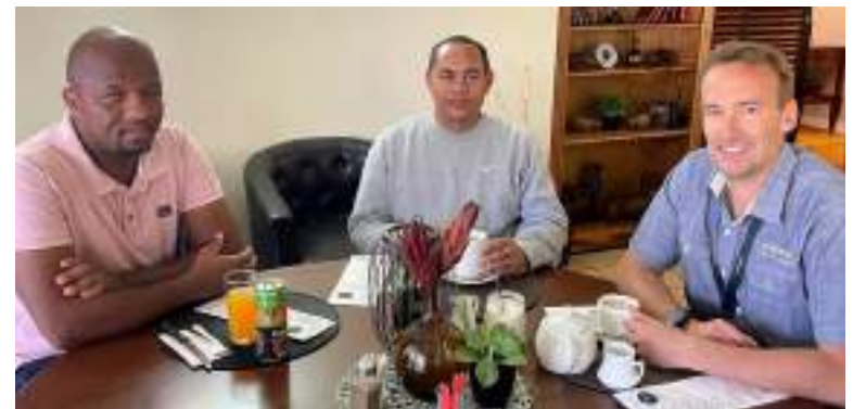
RECOGNISING OUR SAFESENTRY STARS