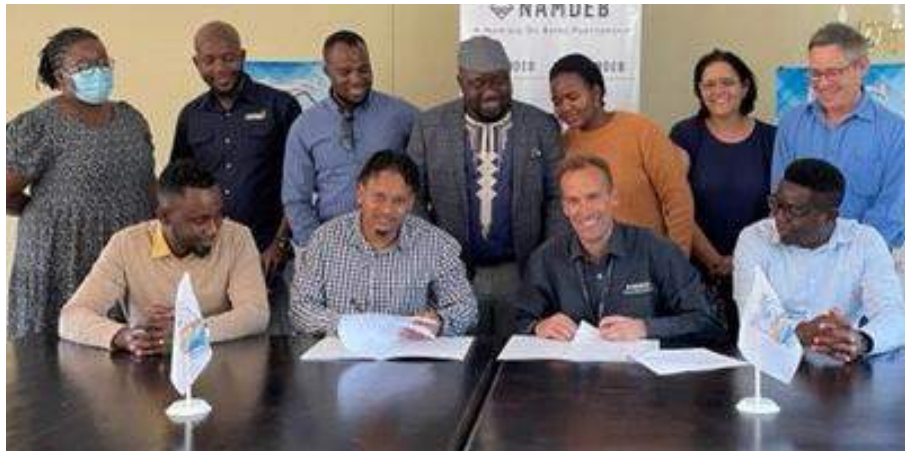
PROPERTY SALES AGREEMENT SIGNING - JUNE