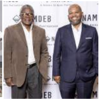
CELEBRATING LIFE OF MINE EXTENSION WITH KEY STAKEHOLDER