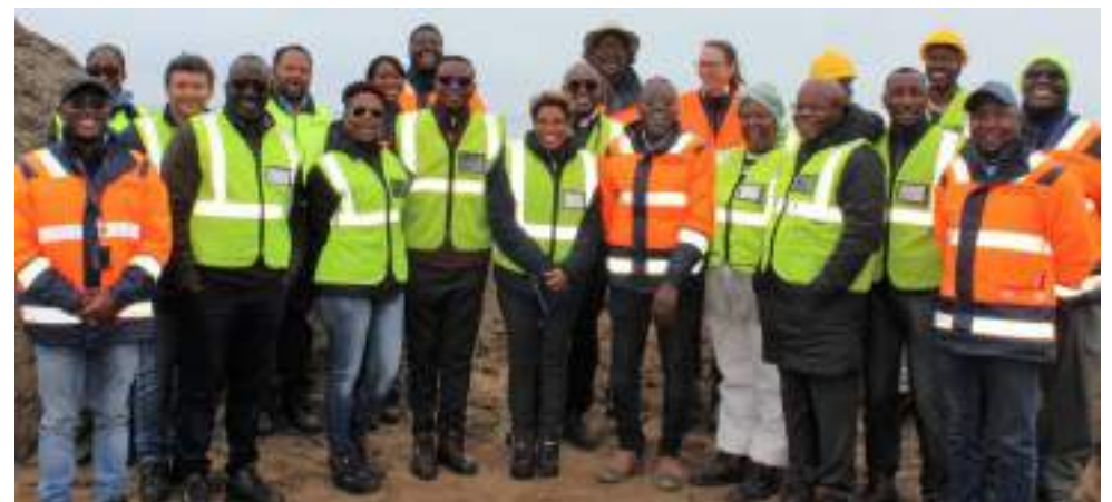
NUST LEADERSHIP VISIT - JULY