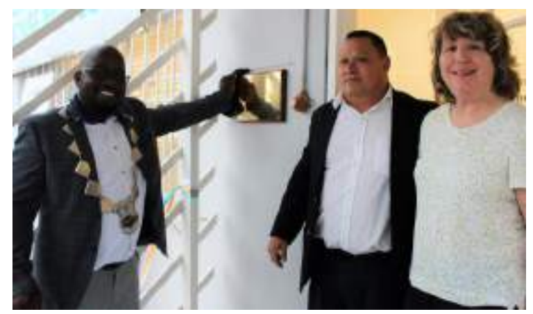
OPENING OF THE JASPER HOUSE MUSEUM