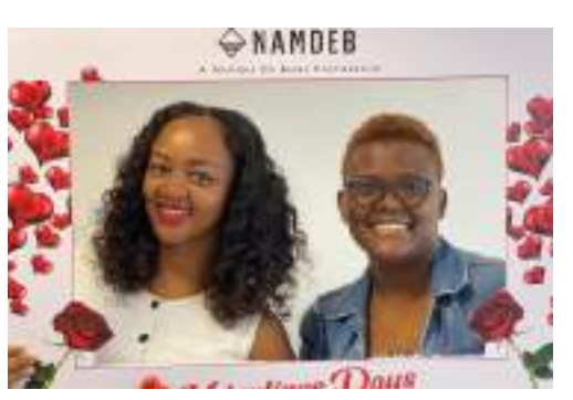
CELEBRATING IVALENTINE'S DAY - FEBRUARY