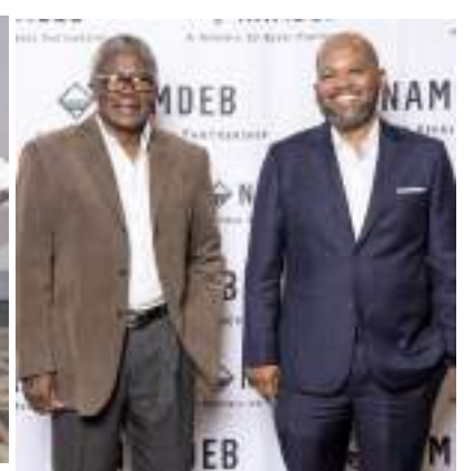
CELEBRATING LIFE OF MINE EXTENSION WITH KEY STAKEHOLDER